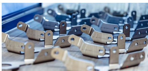
In their own sheet metal processing MERZ processes between 10 and 15 tons of thin sheet daily in a 3-shift operation. A large variety of parts with quantities of 1 to 1,000 as well as a high time pressure are challenges that come with daily work.