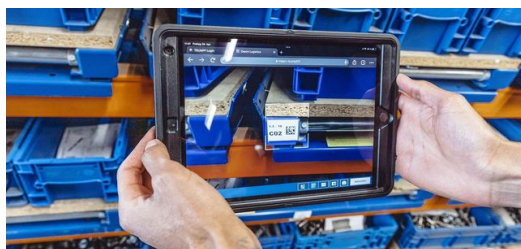
Employees at every workstation register every work step from beginning to end on a tablet in an App. The mobile access to all information makes daily work easier and brings transparency to the procedures.