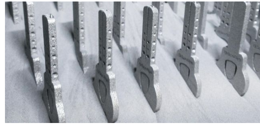
The 3D printing process enabled the young engineers to completely redesign the traditional key.

The more researchers discover about laser light and how it works, the more these findings give rise to ideas for applications and business concepts. Similar to the famous “Stanford boys” of Silicon Valley, many of this latest batch of start-up founders are post-grads and post-docs who spin off a market-able idea from their research work and then team up with venture capitalists who have their eye on a profitable investment. The fact that these ideas stem from general research rather than a narrowly-framed user problem makes them more diverse than ever before.