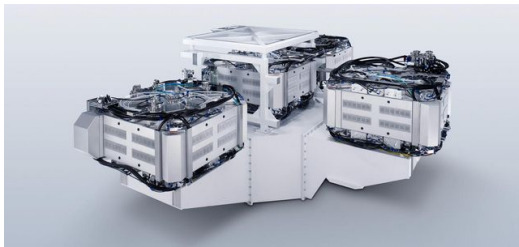
Since the beginning of 2014 TRUMPF has delivered its third-generation laser systems to ASML in Netherlands, the only manufacturer of EUV photolithography systems in the world.

Secondly, it is only the wavelength of 13.5 nanometers that makes it possible to manufacture the layer systems required for optical imaging at sufficiently high reflectivity. Refractive optical elements – such as lenses – absorb this wavelength. That is why EUV systems work exclusively with mirrored optical elements. The very short wavelength is also the reason why the entire process has to take place in a vacuum, since air would also absorb the EUV radiation.