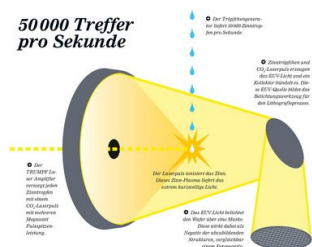
Functional principle of EUV lithography

The laser thus strikes 50,000 tin droplets per second. The tin atoms are ionized and a high-intensity plasma is created. A collector, using a multi-reflection configuration, catches the EUV light emitted by the plasma, focuses it, and ultimately transfers it to the lithography system to expose the substrate.