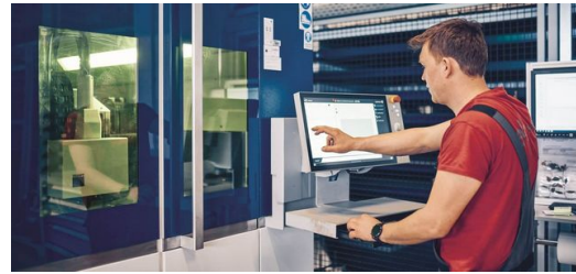
Sought-after partner: Elpro Križnič is a byword for high-quality turnkey solutions in sheet-metal fabrication and in the energy industry.