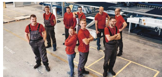
<p>Smart factory: Getting the new machines up and running in Slovenska Bistrica was one thing, but adopting a new shop-floor mindset was quite another! The key was getting everyone to implement the manufacturing philosophy of connected manufacturing in their day-to-day work.</p>