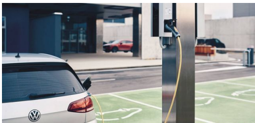
<p>Sustainable development: The charging stations for the company's vehicle fleet are powered by rooftop solar panels.</p>