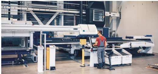
Welding, punching, bending: TRUMPF machines help Elpro achieve top-notch part quality, productivity, and flexibility.