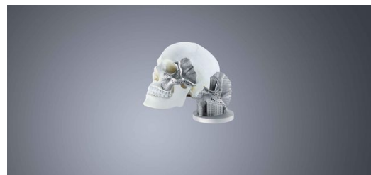
Automated monitoring solutions are indispensable especially in strictly regulated sectors such as medical technology.