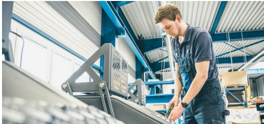
The TruMatic 7000 cuts and shapes the aluminum checker plates for the EGYM units scratch-free and in top quality.

70% of the frame of the unit consists of visually attractive oval tubes made of sturdy mild steel. "We use both our TruLaser Tube 5000 and our TruLaser Tube 7000 for processing. Both are equipped with the bevel cutting option and can insert threads." What would normally take several work steps to implement in conventional manufacturing, TRUMPF's laser tube-cutting machines accomplish in just one operation. The aluminum checker plate for placing the legs comes scratch-free from the TruMatic 7000 , and the TruBend 7036 Cell takes care of the necessary bending edge for fastening to the frame. The electronics and some plastic parts are supplied to Steinhart. After the frames are powder coated, all components are assembled into complete units.