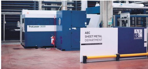
The TruLaser 3030 fiber 2D laser-cutting machine laid the foundations of AEC Illuminazione's close partnership with TRUMPF. Its connection to an automated storage system made production much faster.

achieve this, Bianchi has now connected up 85 percent of the company's machines. The MES generates production schedules and ensures smooth operation of the manufacturing environment. The design engineers can send their CAD drawings straight to the machines, where the data is imported and turned into finished parts as and when they are needed. The MES also collects machine data and key metrics for quality monitoring, machine utilization and production status. "By connecting everything together, we've created a truly transparent production environment. Tailoring our production schedules to the needs of our employees and machines helps to shorten throughput times and improve on-time delivery over the long-term," says Bianchi.