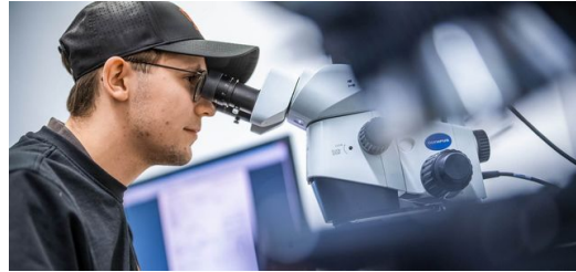
Tireless efforts to enhance and innovate — that keeps customers happy and won the company a "Bavaria Best 50" award in 2023.