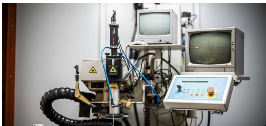
Proven technology remains in service. In parallel, BBW continues to invest in the latest laser systems and steadily expand its portfolio.

Beam shaping? Correct. BBW is at the very cutting edge of laser processing. Beam shaping is naturally part of that mix. As Bürger explains, of the 50 or so laser systems in operation at BBW, a number of them are earmarked for developing this technology. "There's a lot riding on beam shaping. It provides a way of dealing with a number of thorny issues, such as ensuring that the weld pool remains stable during laser welding. At BBW, what we really need is variable beam shaping. That's because fixed optics are not economical for the small batches that we produce for our niche markets."