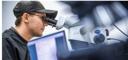
Tireless efforts to enhance and innovate — that keeps customers happy and won the company a "Bavaria Best 50" award in 2023.