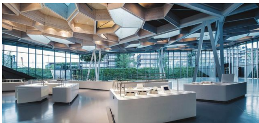
Meeting place: The Blautopf is more than just a staff restaurant.