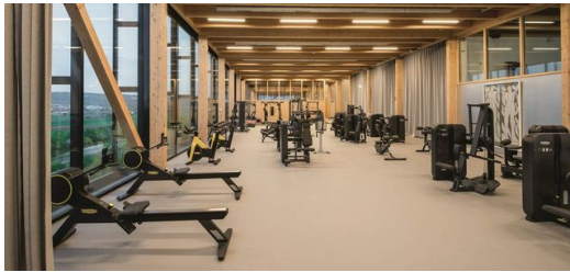
Fitness center: How's the rush hour looking on the highway? The fitness center in Ditzingen is the perfect place to check for traffic jams.