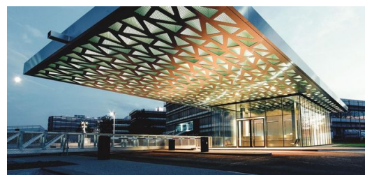
<p>Main entrance and reception: A glance at the ceiling is all it takes for visitors to see that TRUMPF machines are the perfect choice for laser-