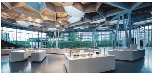
Meeting place: The Blautopf is more than just a staff restaurant.