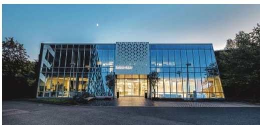
Customer center: TRUMPF impresses customers with its combination of outstanding industrial architecture and superb product quality.