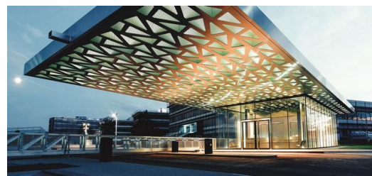
Main entrance and reception: A glance at the ceiling is all it takes for visitors to see that TRUMPF machines are the perfect choice for laser-