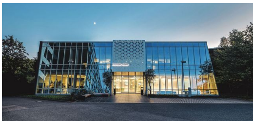
Customer center: TRUMPF impresses customers with its combination of outstanding industrial architecture and superb product quality.