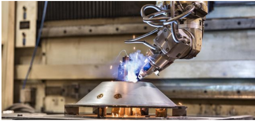
ELFIM uses the Lasercell 1005 for various applications of laser technology such as 2D and 3D cutting or welding and also for laser metal deposition.

perform a 3D scan of an existing replacement part.