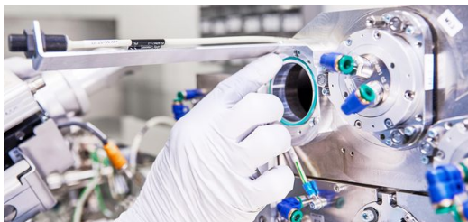
A mechatronics engineer installs a mirror mounting.

Which brings us back to the laser; the idea behind the laserbased fabrication process can be expressed fairly simply. Basically, a tin generator fires 50,000 droplets of tin a second (!) through a vacuum chamber and a laser pulse strikes the droplets as they shoot past. This is a kind of high-tech version of clay target shooting – and it generates a plasma in the vacuum that emits EUV light at the desired wavelength of 13.5 nanometers. A collector gathers up the EUV light and delivers it to the lithography system to expose the wafer. To produce the laser pulses, TRUMPF developed a one-of-a-kind beam source based on its CO2 laser technology – the TRUMPF laser amplifier. In five amplifier stages, this device boosts a weak laser pulse more than 10,000 times, outputting more than 30 kilowatts of mean pulse power. Pulse peak power can be as high as several megawatts.