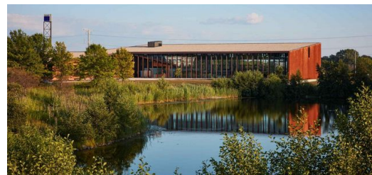
In Chicago, TRUMPF inaugurated a Smart Factory for networked sheet metal processing in 2017.