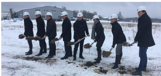
The ground-breaking ceremony for the new production hall at the TRUMPF site in Hettingen in January 2019. 120 employees are to move into the competence center in two years.