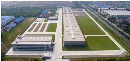
In May 2018, the TRUMPF subsidiary JFY in Yangzhou opened the Group's largest production site worldwide to date. The production area is 19,000 m 2 .