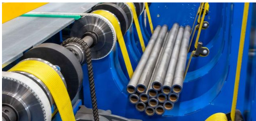
After cutting the tubes on the TruLaser Tube 7000, the tubes are transported to the production network where the robot places them in a bundle space and then distributes them on a table.

During the production of the cross tube for the trailer coupling, the tube process chain now guarantees a smooth process: The TruLaser Tube 7000 fiber cuts the tubes and inserts the contours. The tubes are then transported to the transfluid® tube bending machine and automatically loaded by the robot. After being bent, the robot transfers the components to the TruLaser Cell 8030. This is where the final processing takes place. The 3D laser system cuts out contours that cannot be inserted before bending because they would otherwise be deformed.