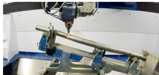
The 3D laser system TruLaser Cell 8030 from TRUMPF can be used to cut out accurate contours, that cannot be inserted before bending because they would otherwise be deformed.